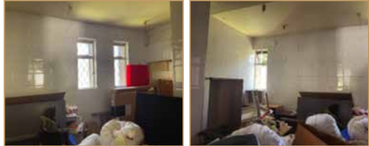
Proposed area for Office and Meeting Room