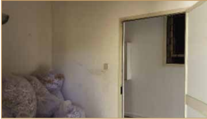
Proposed area for receptionist

Welcoming and efficient reception space to greet clients warmly upon arrival.