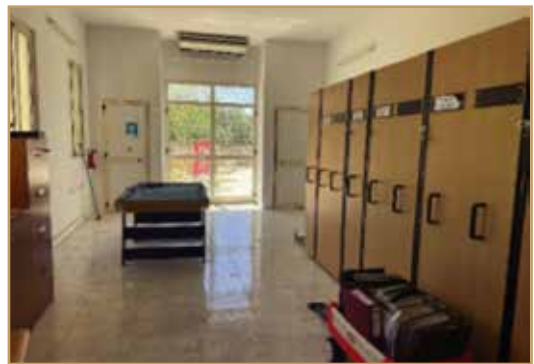
Proposed area for Clinic 1 and Clinic 2