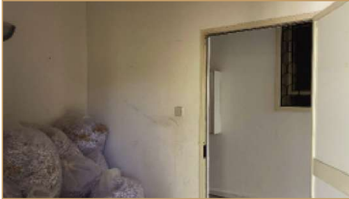
Proposed area for receptionist

Welcoming and efficient reception space to greet clients warmly upon arrival.