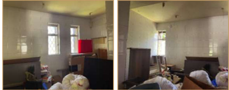
Proposed area for Office and Meeting Room