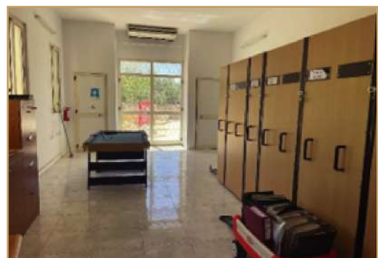
Proposed area for Clinic 1 and Clinic 2